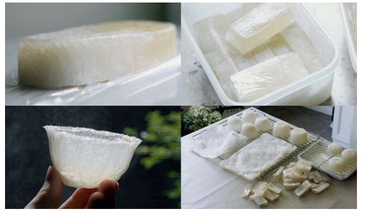
Figure: Red algae as a source for agar.