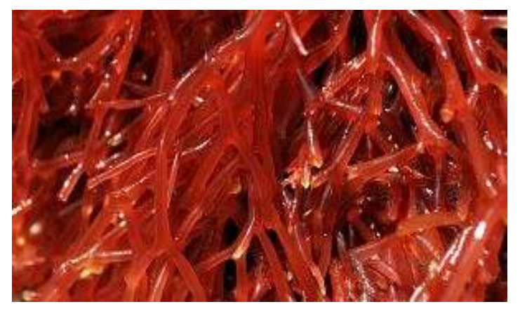
Figure: Red algae as a source for agar.

Currently, the group is designing a box-like package, which has a cushioning structure derived from the freezing process for delicate objects (like a fragrance bottle), cushioning sheets for wrapping and nugget-like cushioning. AMAM is also exploring the possibility of agar-derived plastic material. The material can improve the water-retention property of soil, and when released into the oceans, it would obviously not pose a threat to marine lives.