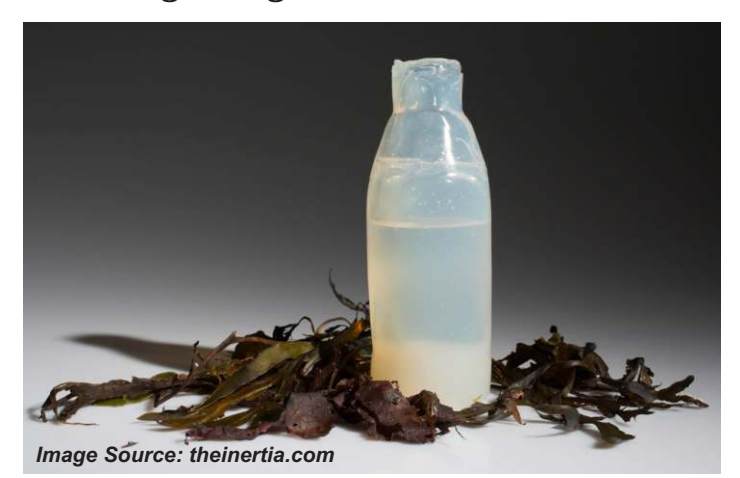
Ari Jonsson, a design student at the Iceland Academy of the Arts invented a bottle made up of agar. He demonstrated his work at Design March, a design festive held in Reykjavik, Iceland in 2018. As a matter of fact, disposable water bottles are convenient but are dreadful for the environment and can be loaded with BPA's (BPA or bisphenol A). BPA stands for Bisphenol-A, an oestrogenimitating chemical used to produce reusable plastic products. It is use to produce disposable water bottles and babies' milk bottles and plastics you might use for storing leftover food. Small amounts of BPA can leach into the food and drink inside such containers.

The presence of BPA is a concern because numerous scientific studies have shown that BPA mimics the actions of estrogen and binds to the same receptor in the body. Oestrogen is normally involved in breast development, regulating periods and maintaining pregnancies. Animals exposed to BPA develop abnormal reproductive systems, However, adverse effects associated with high doses of BPA are uncertain.