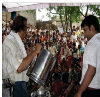
DRDO Filters being installed in Tiwaritola, Ballia (UP)