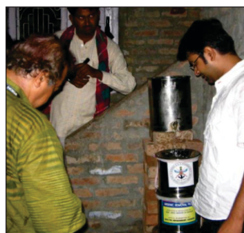
Domestic Arsenic Removal filter